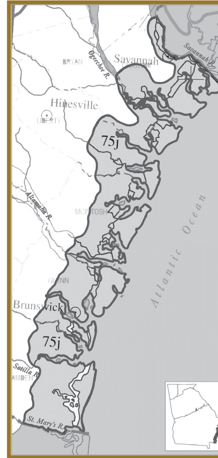
Coastal Georgia - Climate Zone: 8B - Eco-region 75j

The coast of Georgia is a mosaic of interdependent habitats and natural communities. Activities in upland areas, where you live and garden, impact marine, estuarine and freshwater systems. How we plant and tend our gardens and landscapes also affects plant and animal diversity and health. Maintain the natural habitats you have and mend those that are fragmented. You can make a difference whether working at the landscapes level or planting in containers.